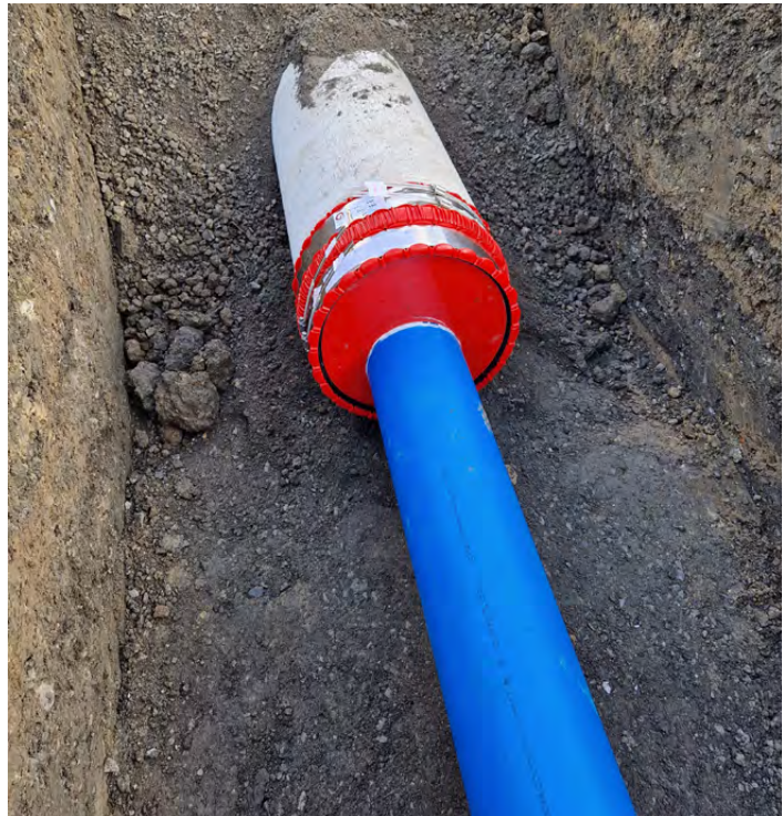
VPC® pipe coupling with VPC® Delta Ring

Note: A level invert connection is assumed. Please specify any deviations!